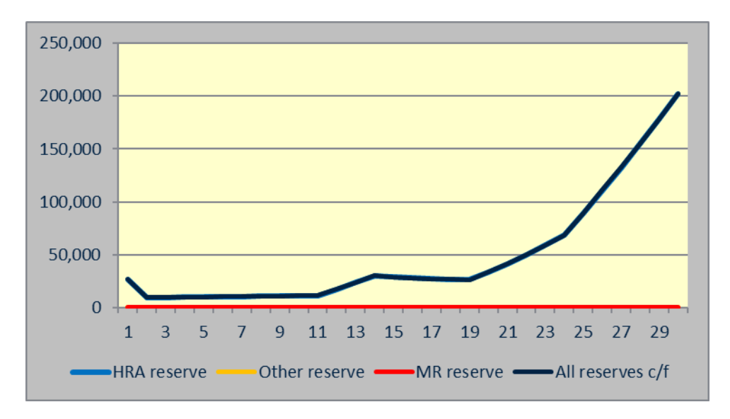
Chart 1 – Projected HRA Balances

6.2.4 The opening CFR (Capital Finance Requirement) is £365m of which £333m is funded from borrowing. Additional borrowing will be required with borrowing peaking in year 11 at £669m from the opening £365m. This is within the projected headroom for the HRA and is demonstrated in Chart 2 & the code identifiers.